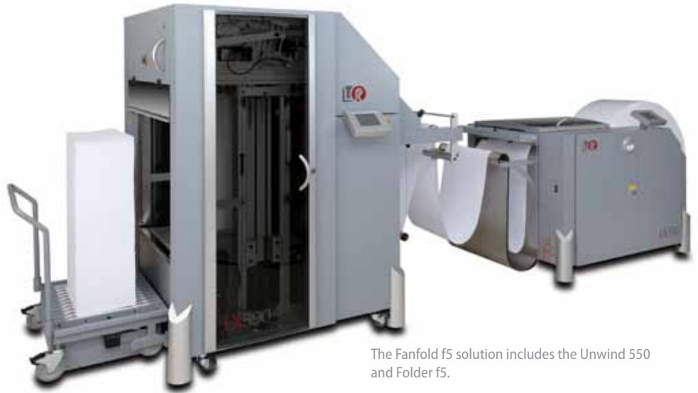
The Fanfold f5 solution includes the Unwind 550 and Folder f5.