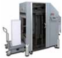
Automatic stack eject.

The Folder builds a stack up to 39" high, continually compressing the perforation folds to ensure a flat stack for reliable inserter feeding. When the maximum height is reached, the stack is automatically ejected onto a fanfold trolley and a new stack begins forming immediately, allowing the printer and folder to continue working nonstop.