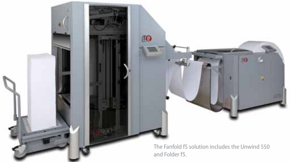
The Fanfold f5 solution includes the Unwind 550 and Folder f5.