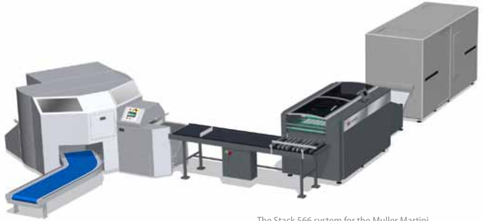
The Stack 566 system for the Muller Martini SigmaBinder includes the Unwind 550, Cutter 561, Stacker 566 and conveyor system.