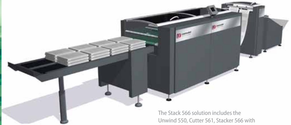
The Stack 566 solution includes the Unwind 550, Cutter 561, Stacker 566 with optional Buffer 530 or Merger 535.