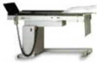
Transfer to AutoLoad.

a web up to 18 inches wide into a digital printer. Once material is printed, the RST3 AutoLoad Tilt Table works in conjunction with the RS Folder to fanfold stacks and unload forms. The Tilt Table pivots in either direction (for A-Z or Z-A processing) to an upright position to deliver up to 10,000 forms at a time. The four-section StackRack carts hold up to 40,000