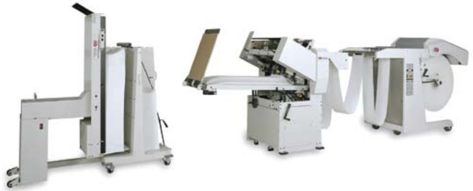
The RS AutoLoad solution includes the RS Unwind, RS Folder, and RST3 AutoLoad Tilt Table.