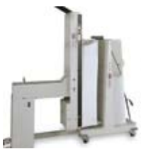
Tilt and load StackRack.

forms for continuous feeding of high-speed inserters. Smaller carts are also available for off-site movement of forms or for more frequent trips to the mailroom.