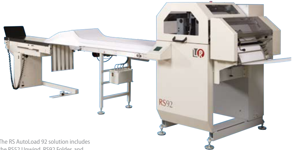
The RS AutoLoad 92 solution includes the RS52 Unwind, RS92 Folder, and RST3 AutoLoad Tilt Table.