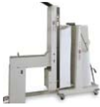
Tilt and load StackRack.

All components are modular, compact and are designed to dramatically improve workflow.