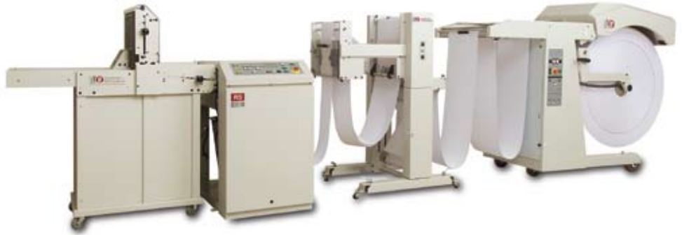
The RS Stack SP solution includes the RS Unwind (RSU4 Unwind shown), RS Slit/Merge, RSC8 Cutter, and RSV3 Stacker.